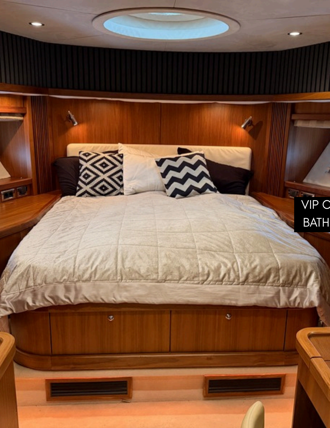
VIP CABIN & BATHROOM