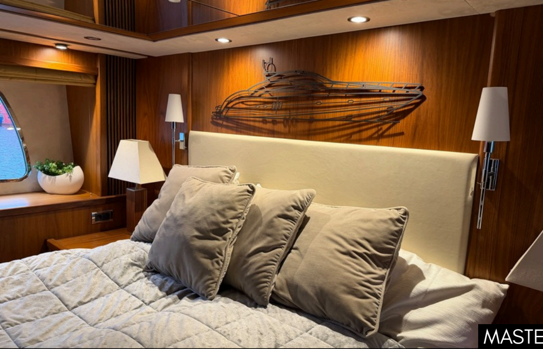
MASTER CABIN & BATHROOM